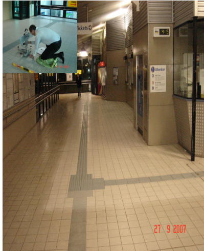
Lidcombe Railway Station, showing before and after treatment, testing and on-going cleaning.

“ It’s a testament to the effectiveness of my program that the relationship between Non-Slip and Railcorp continues to grow...” Jay Ganatra, C.E.O. Non-Slip Floor Solutions